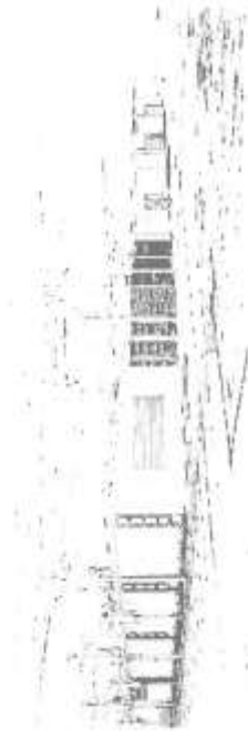
ELEVATION FROM STREET SIDE