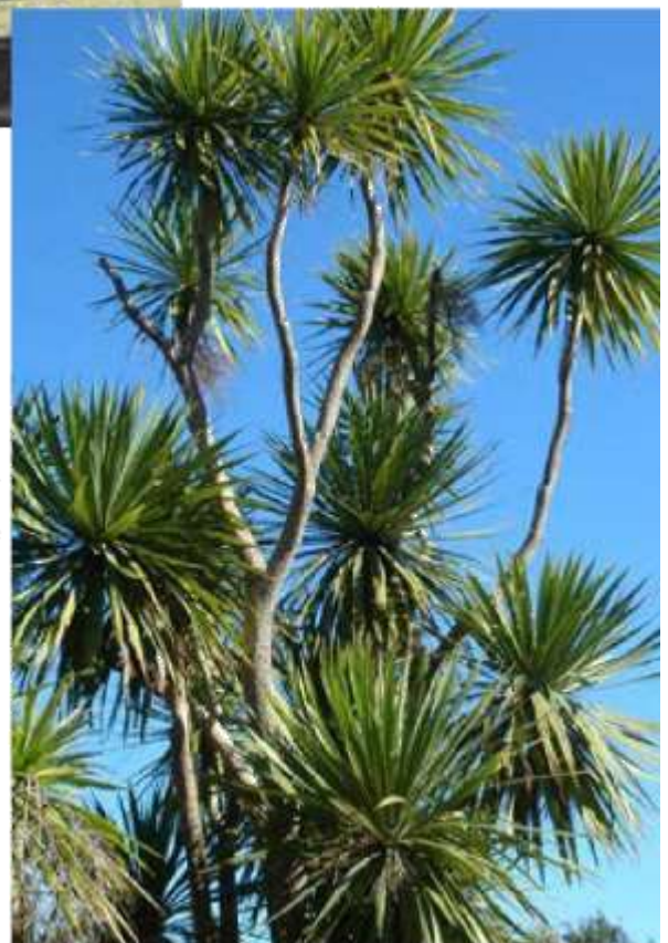
Xylocarpus australis (cabbage tree) The cabbage tree has a straight trunk and a densely rounded head. Each stem on this iconic NZ native is crowned by a rosette of strappy long leaves. Dense panicles of creamy fragrant flowers appear late in the summer. Withstands waterlogged soil but in warm, humid areas keep the root zone cool by mulching or shade-planting. Good coastal option.