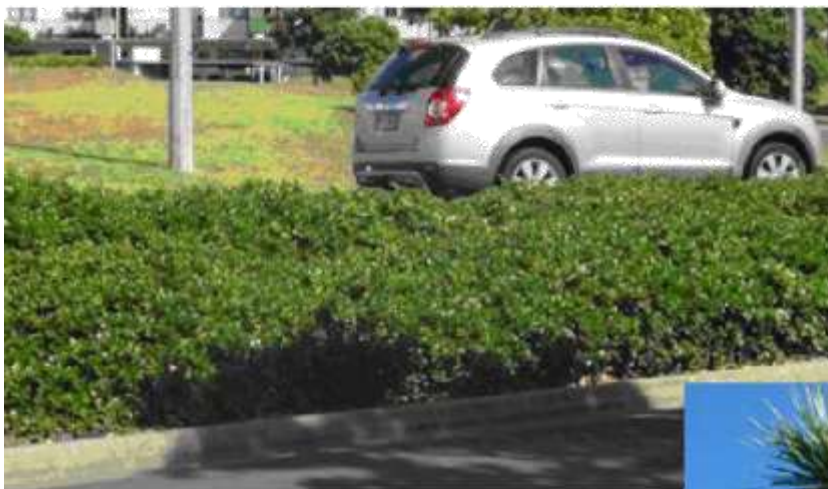
Coprosma repens 'Poor Knights' Semi-prostrate form of Coprosma repens from the Poor Knights Islands. Best in sun though tolerant to coastal and humid conditions. Fast growing and easy to maintain. Prune to maintain foliage production.