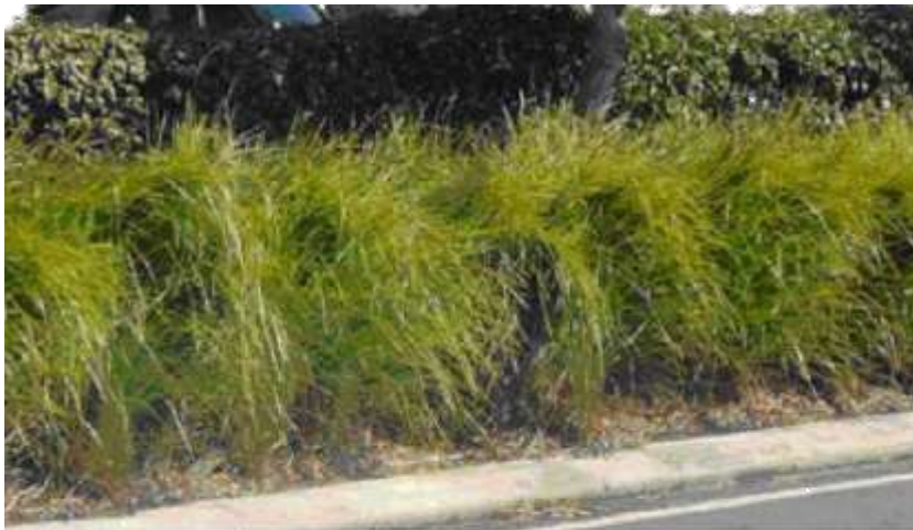
Lomandra Tanika (Akoranga Drive) Lomandra Tanika has proven to be one of the toughest, most reliable landscape plants. Tanika is much finer than the common type of Lomandra longifolia which will produce an attractive flower head in spring. Tolerant to windy, dry conditions and suitable for a variety of landscape applications.