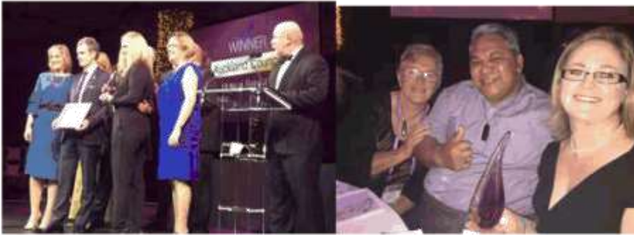
LGNZ Awards presented at conference in the Dunedin Centre, a few images below.