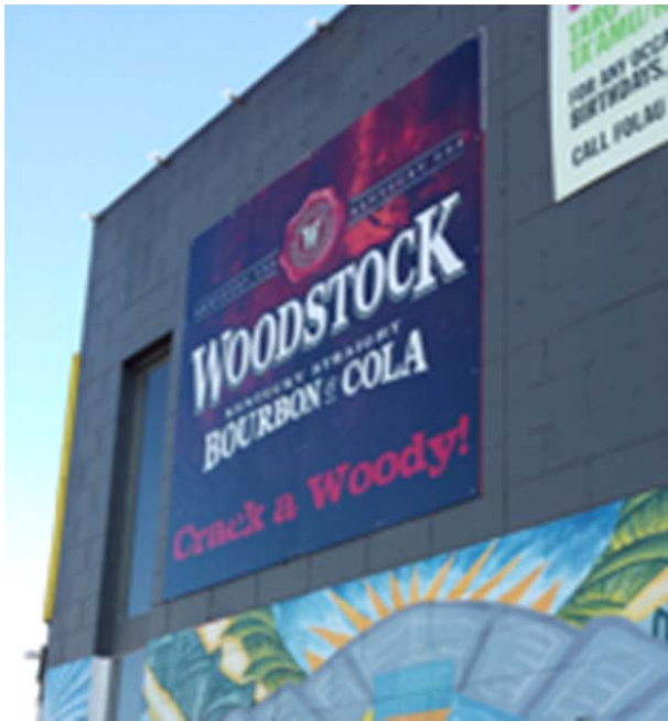
Paradise Bar Bairds Road, Otara