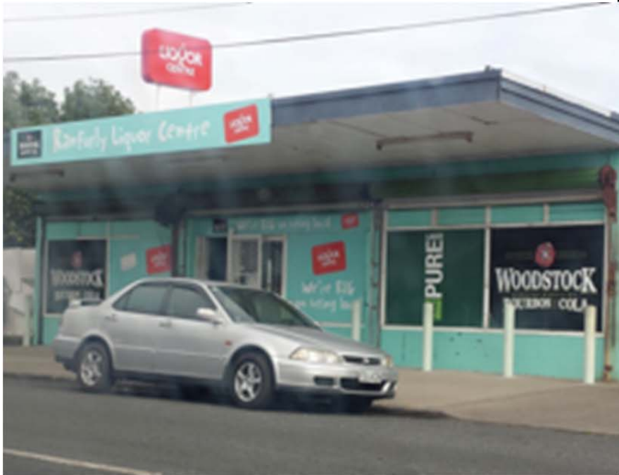
Ranfurly Liquor Centre 17A Ranfurly Road, Papatoetoe