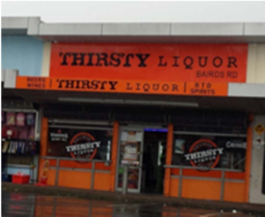
Thirsty Liquor Bairds Road 2/28 Bairds Road