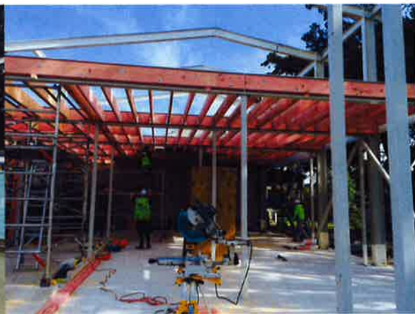
19 July 2016