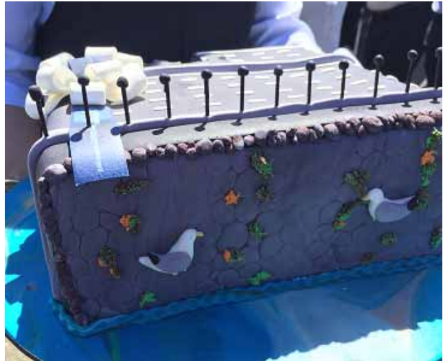
Unitec's Gradfest 2016, held at building 1, Carrington Road