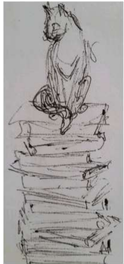
Concept sketch of Benjamin sculpture. Benjamin to be life-size. To be cast in bronze Approx height of whole piece one metre

Please email benjaminthelibrarycat@gmail.com if you would like regular up-dates or to express an interest in donating.