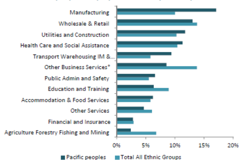
Pacific peoples employment share by industry, Dec 2016