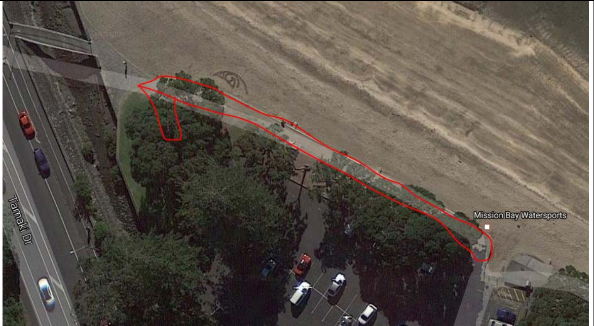
Site photo (path in red)

Include any supporting maps/photos with this form.