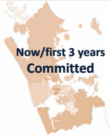
Now/first 3 years Committed