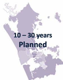
10 – 30 years Planned