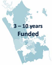
3 – 10 years Funded