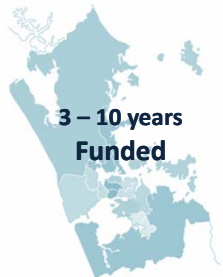
3 – 10 years Funded