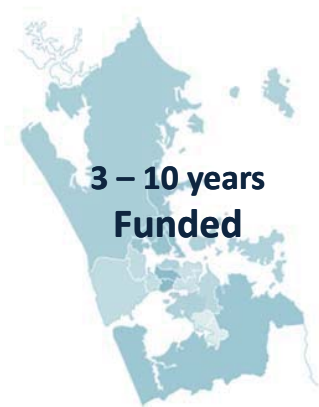
3 – 10 years Funded