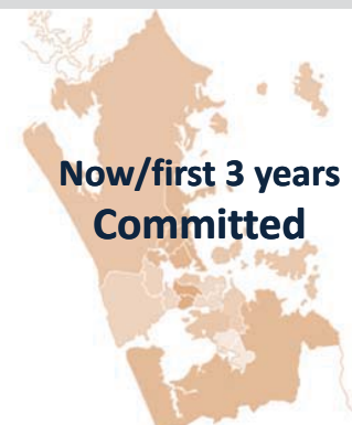
Now/first 3 years Committed