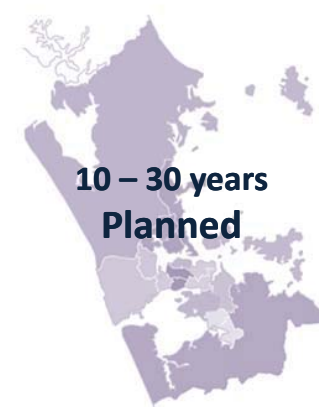
10 – 30 years Planned