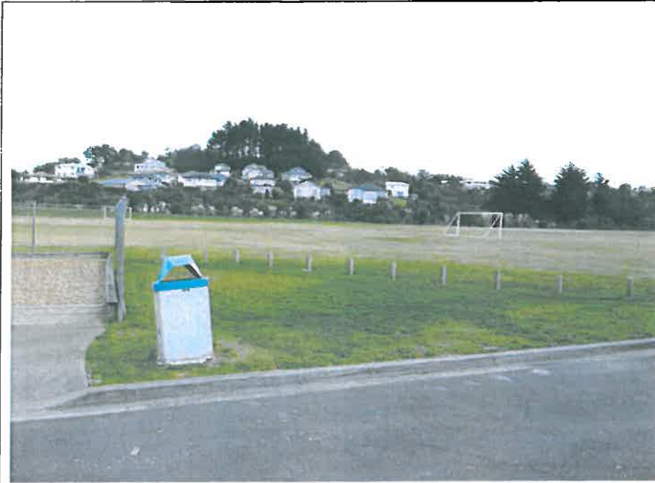
Figure 12: Option One: North of Playground – Proposed Location

Option one would offer a location which has optimal surveillance from the adjacent school if orientated towards the car park facing east. This location also provides maximum visibility of the front of the toilet block from the car park.