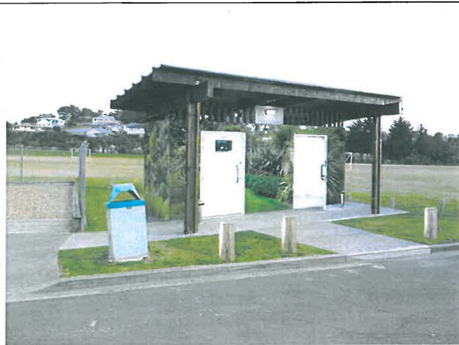
Figure 13: Option One: North of Playground – Artists Impression