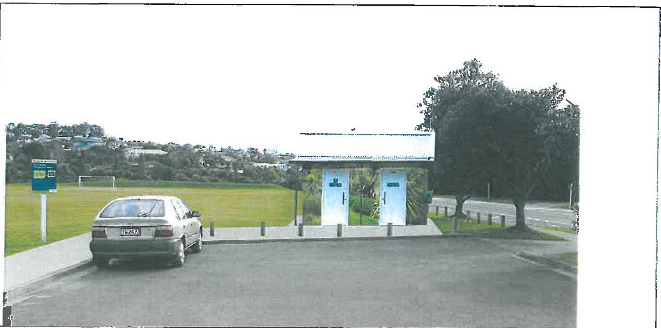
Figure 15: Option Two: North of Car Park – Artists Impression