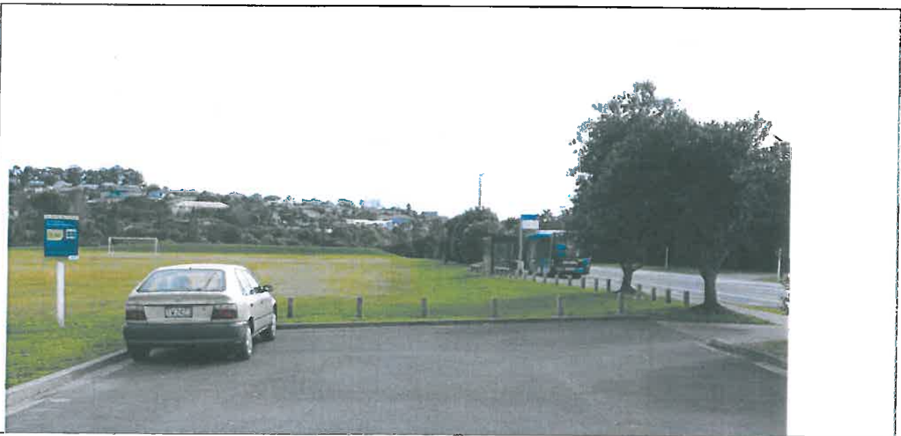
Figure 14: Option Two: North of Car Park – Proposed Location

These trees would however reduce the visual impact of a new toilet in this location but detracts from elements of crime prevention through environmental design (CPTED), requiring open vistas and clear sightlines. If option two was seen to be the most feasible the Pohutukawa trees should have some crown lifting undertaken to create clear vistas to both toilet entrance ways.