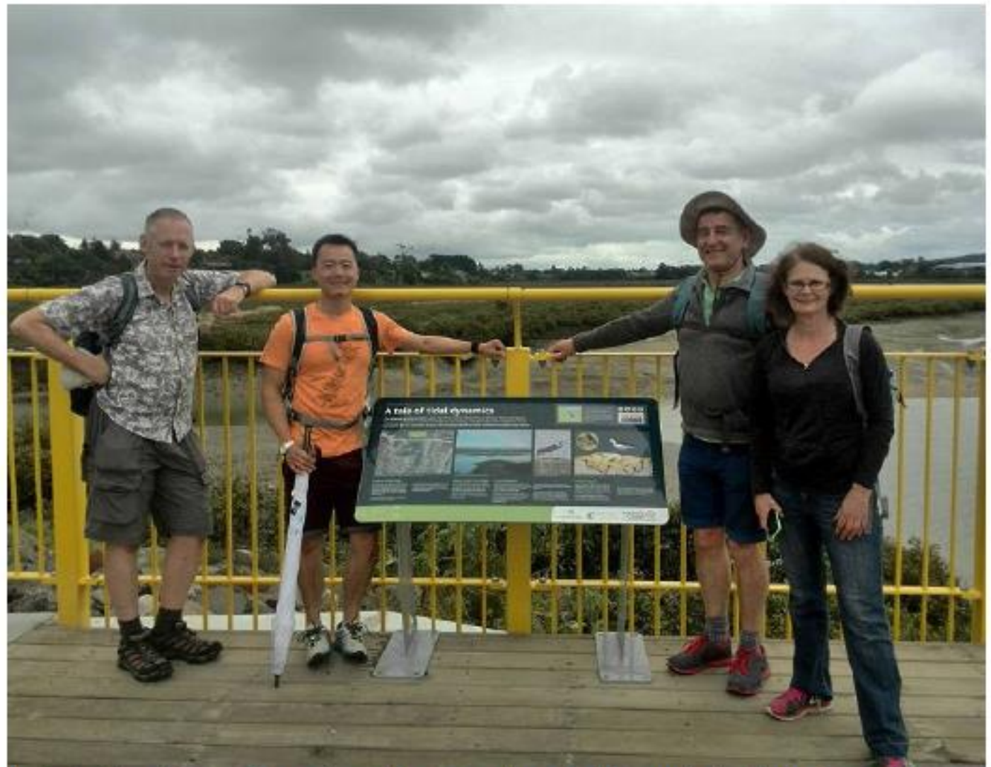
Harbourview Forest & Bird executive members standing at a recently completed interpretation sign along the Causeway Motorway upgrade. We developed three signs that covered the wetlands and mudflat ecosystems here.