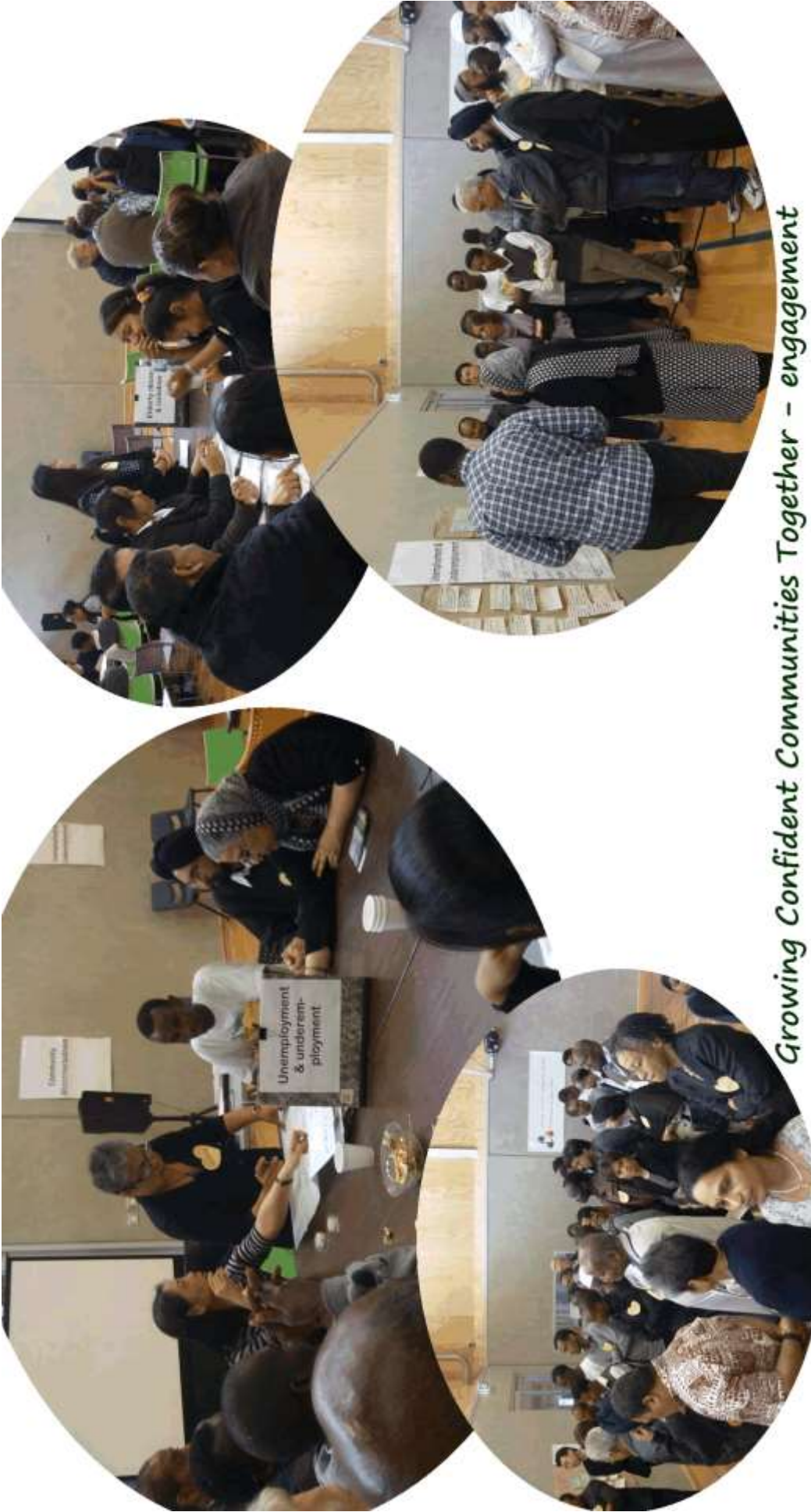
Growing Confident Communities Together - engagement