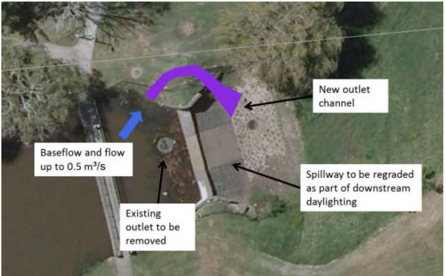
Figure 2: Conceptual Design of Low Flow Channel and Fish Passage