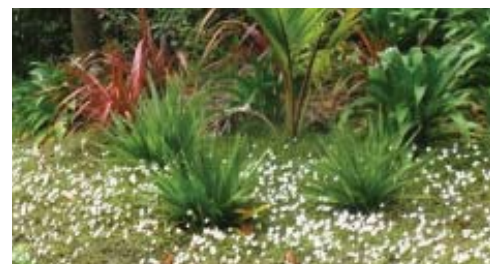
Low amenity planting