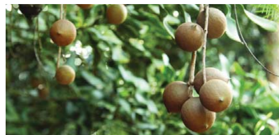
Proposed specimen trees i.e nut trees