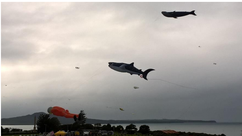
Manu Aute kite day supported by Orakei Local Board