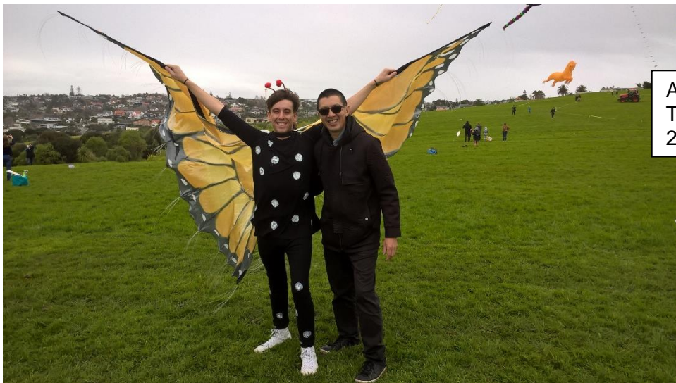
Attending Manu Aute Kite day – Takaparawhau Reserve; 8 July 2018