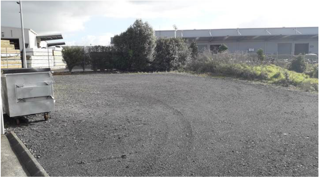
Figure 4: Photo of 96R Cryers Road looking towards the south-eastern border of the site.