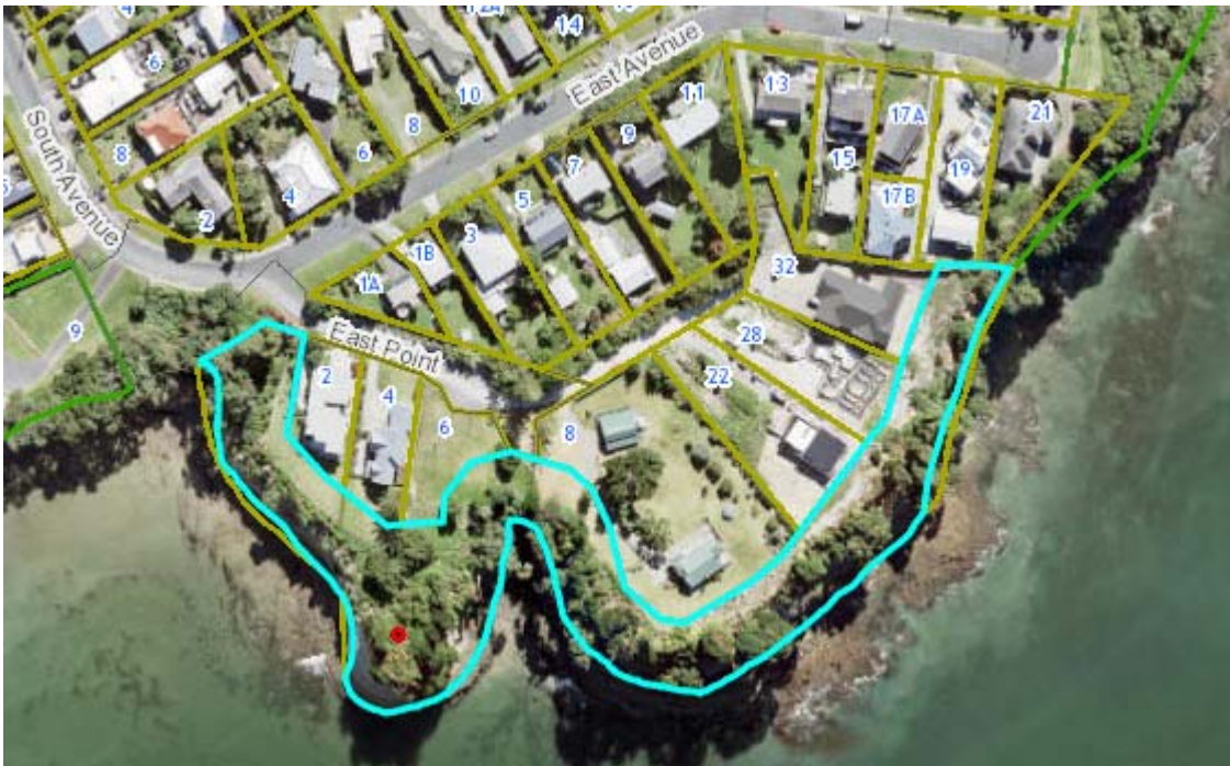
1. East Avenue Tiri Road Esplanade Reserve