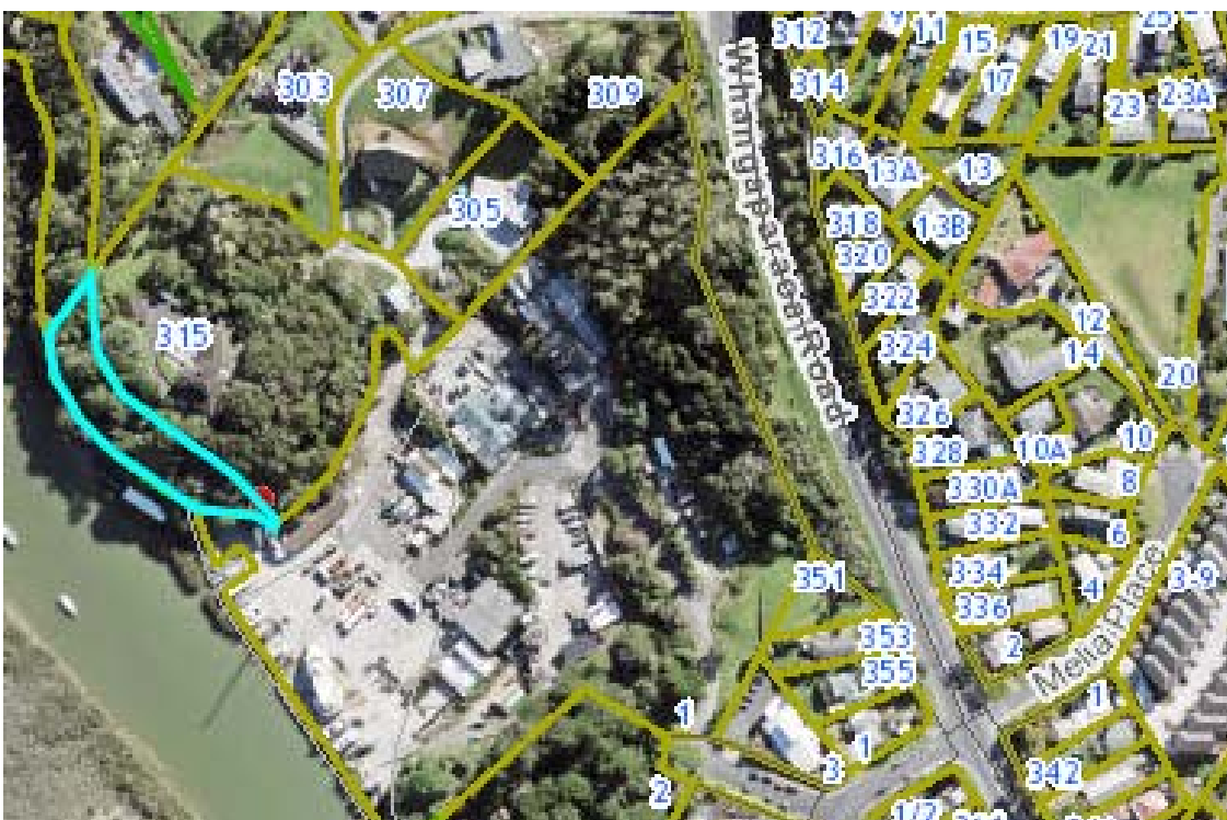
2. Karaka Cove (Lot 8 DP 429799)