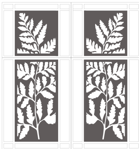
Figure 2 – Gate Panel Design