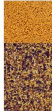
WETPOUR: Wetpour pattern with combination of colours 'earth yellow' (top) for accents and 'sand-blend' (bottom) for bulk surface colour.