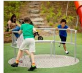
JUNIOR PLAY: Pipework and slide sides autumnal colours