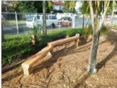
TREES: Balisee Beams, Rope climber on ground & hanging