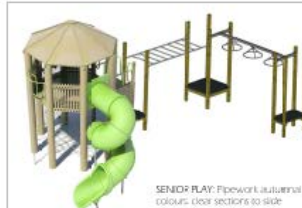
SENIOR PLAY: Pipework autumnal colours: clear sections to slide