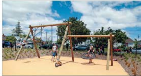
PLAY: Play modules, slides, inclusive carousel, swings, seesaw