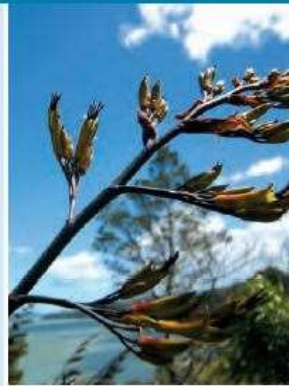
Waiheke island walks