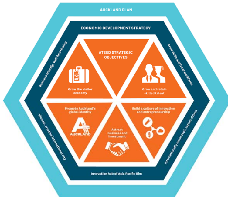
Figure 1 – ATEED’s Strategic Framework (2017-20)

Through these objectives, we can connect Auckland-wide strategies (the Auckland Plan and Economic Development Strategy) and ATEED’s ongoing strategic interventions, growth programmes and projects. The framework below provides the organisation with focus on those areas of our role that will make a difference to Auckland, both regionally and locally. The key strategic objectives are supported by more detailed action plans, investment proposals and delivery partnerships.