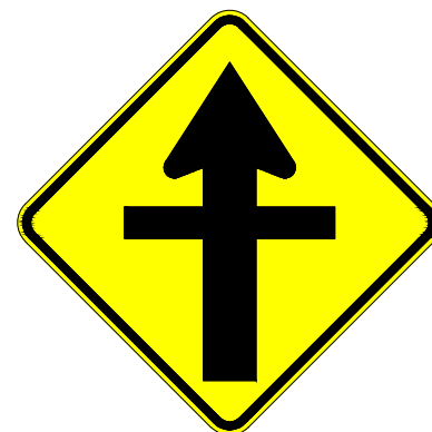
PW-9 INTERSECTION CROSSROADS JUNCTION CONTROLLED PRIORITY ROUTE STRAIGHT AHEAD SIGN