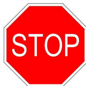
RG-5 "STOP" SIGN