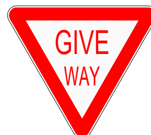
RG-6 "GIVE-WAY" SIGN