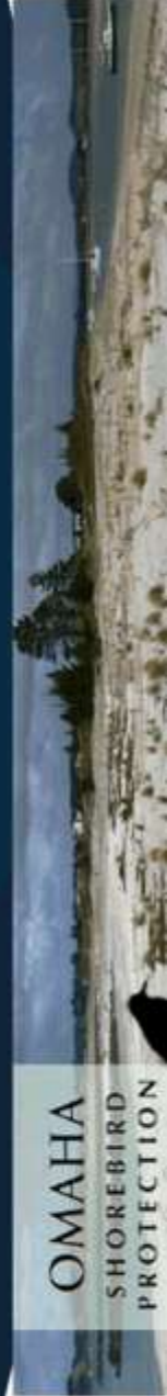
OMAHA SHOREBIRD PROTECTION

Important for OSPT to continue to be responsible for any trapping and predator control carried out inside the predator proof fence, because this is such a special place for the shorebirds. Some forms of traps & the use of poisons could be detrimental to their survival.