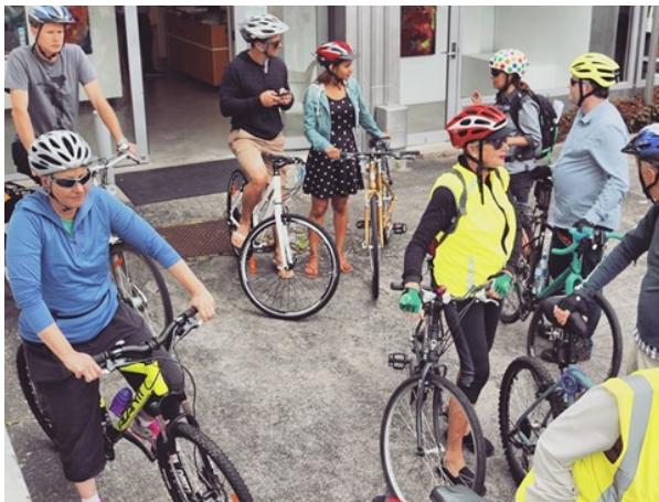
An art-themed cycle tour through Ponsonby