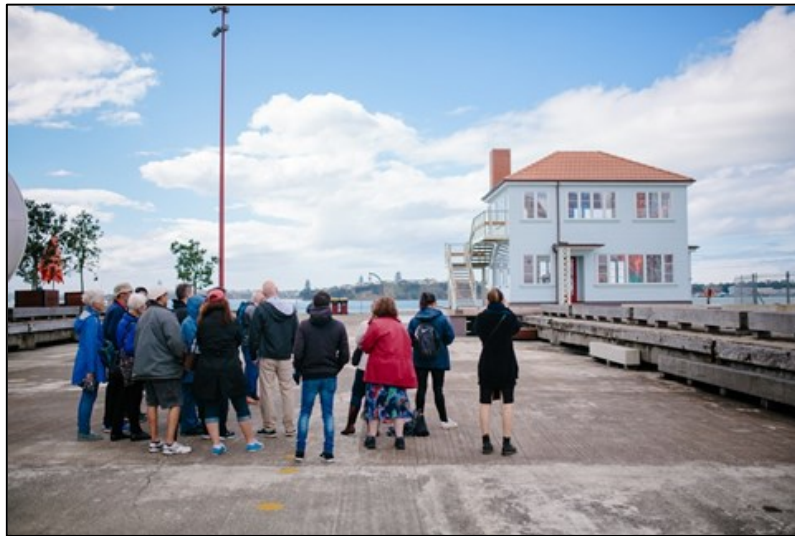
City Art Walk.