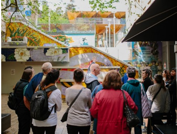
The city centre art walk.