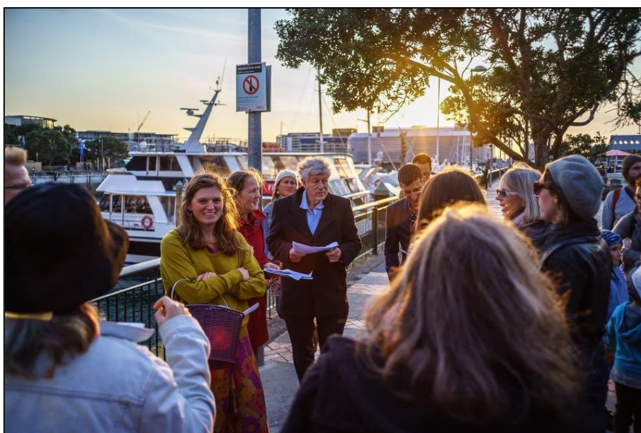
Discussing urban design in the Viaduct during "Jane's Walk".