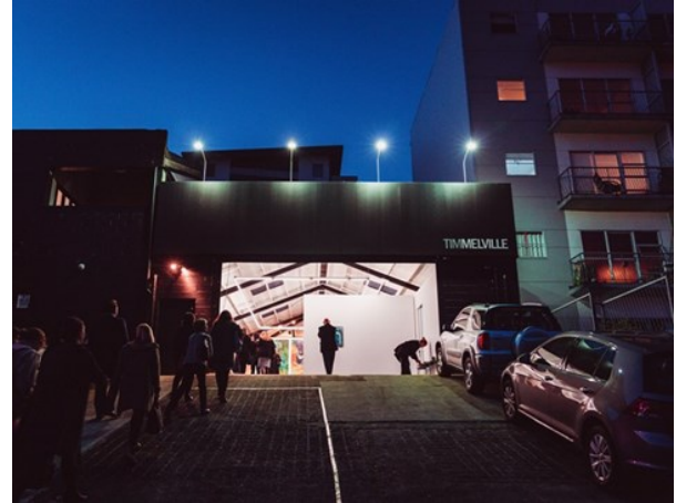
Electric Night K'Road