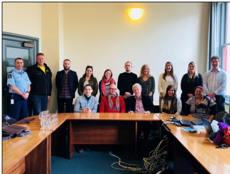
Quarterly Task Force on Alcohol and Safety in the Central City – 7 September 2018

4 Oct Annual Meeting of Charity Services New Zealand at Samoa House, Mangere.