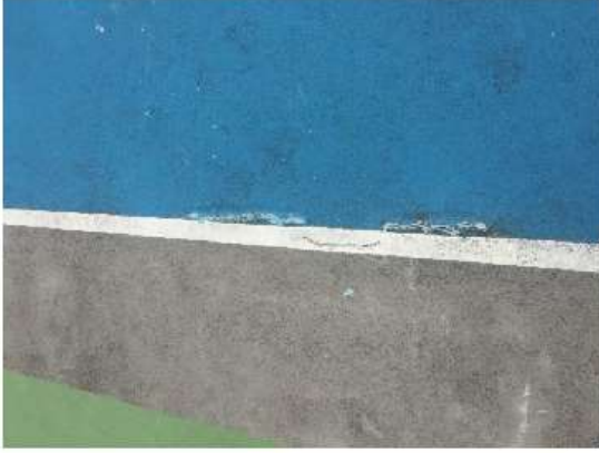
Cracks in underlying