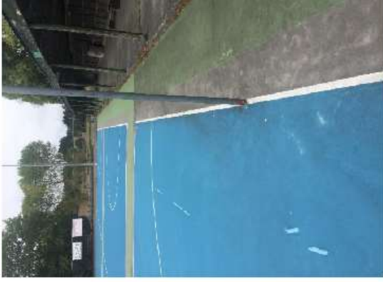
Dis-colouration & mould

Becoming critical and will soon impact on safety Beyond the capacity of Netball Rodney to address Believe issues stem from underlying land drainage issues Need to consider a long-term and multi-code solution