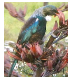
TUI NUMBERS in areas managed for rats (blue) and (red) unmanaged areas. Trend lines diverging.