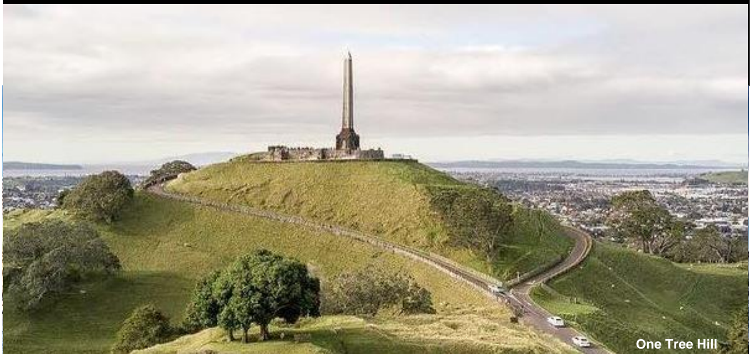
One Tree Hill