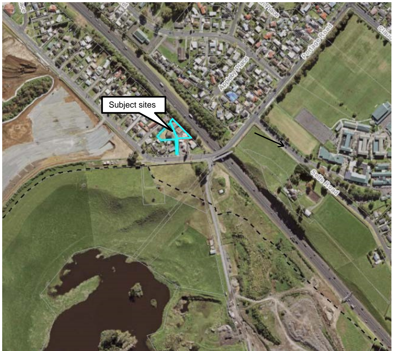
Figure 1: Site locality plan; 265 and 267 Portage Road, Mangere.