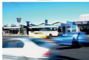
Bus services on Glenfield Road.

Kaipātiki has many transport options, and it's easy to move around and find your way.