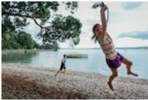
Hilders Park, Beach Haven.

Our people have a sense of belonging, are connected to one another and are proud to live in Kaipātiki.