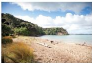
Kauri Point Centennial Park.

People can get to and take pleasure in the Kaipātiki coastline, green spaces and waterways. Our community acts as kaitiaki (guardians) of the environment so that future generations can do the same.