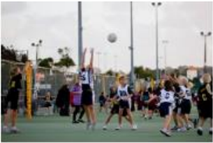
North Harbour Netball.

It's easy to make healthy lifestyle choices in Kaipātiki.