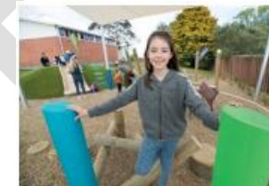
Birkdale community facilities.

We feel fortunate to be home to many great community facilities, so we want to ensure they're well looked after and continue to meet community needs.