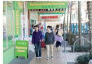
Northcote town centre.

Our villages, town centres and business areas provide local employment and bring people together.