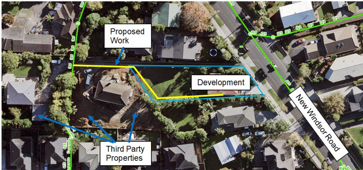
Figure 1: Map of the site and proposed works

The proposed connection from 121 New Windsor Road is to connect to the existing stormwater line within the driveway of 119 New Windsor Road. The proposed stormwater line will cross under the driveways of both 119A and 119B New Windsor Road.