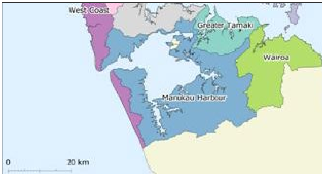
Figure 2. Manukau Harbour catchment.