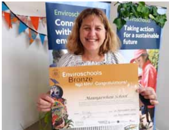
Enviroschools presentation, Western Springs Garden Community Hall