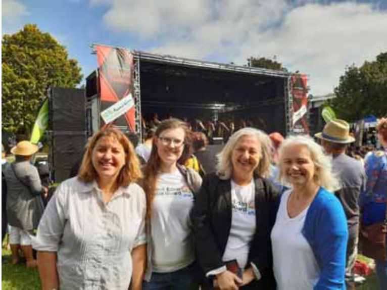
Albert-Eden School Cultural Festival