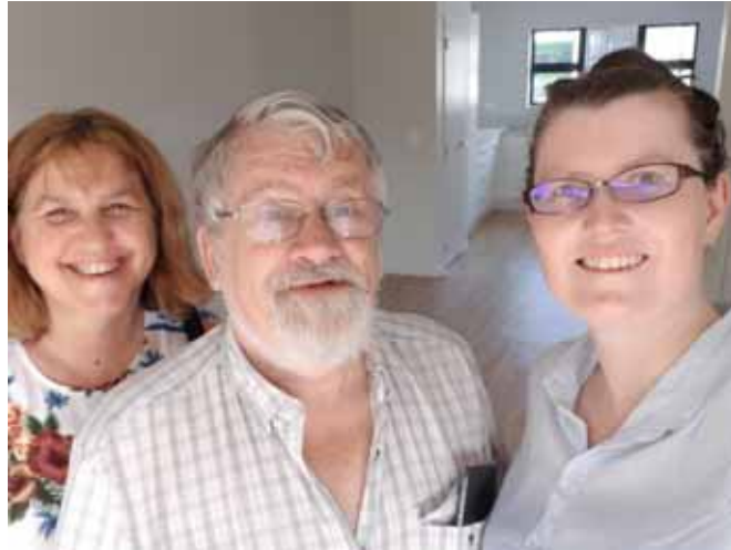
Kainga Ora redevelopments in Waterview