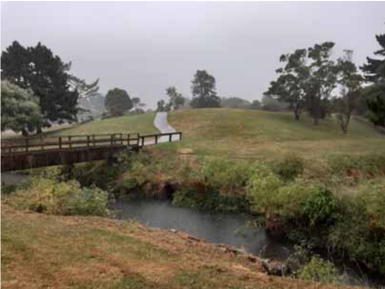
Site visit to Chamberlain Park