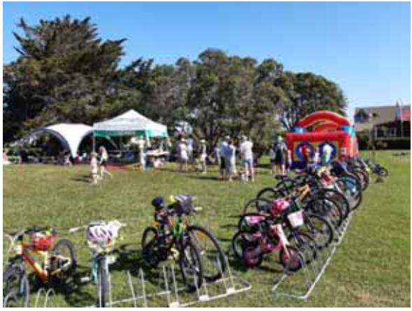
Bike Pt Chev, Coyle Park