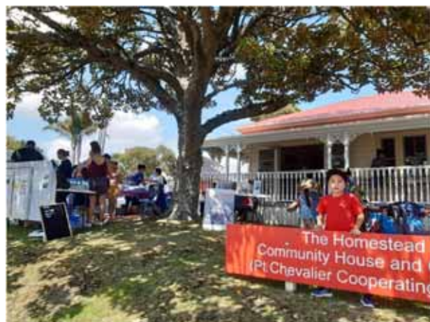
Pt Chevalier Homestead