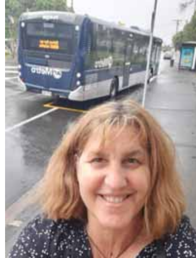
Saving the bus stop for the 650 route to Coyle Park