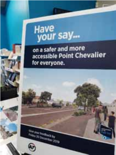
Pt Chev AT consultation