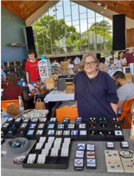
NZ Craft Market, Mt Albert War Memorial Hall