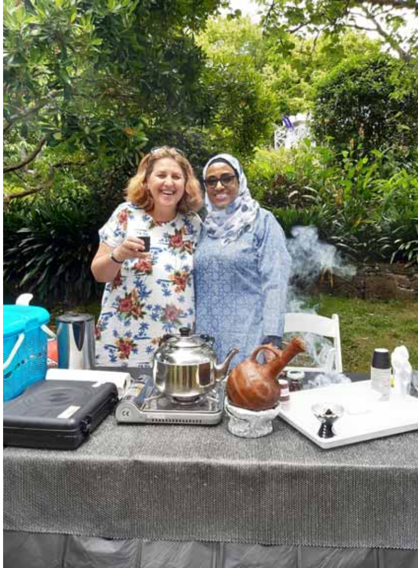
Coffee at the Aotearoa Resettled Communities Coalition event, Alberton House. Thank you!