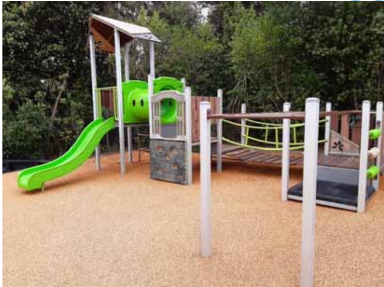
Virginia Reserve's new playground