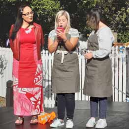
Illuminate Night Market with recreate