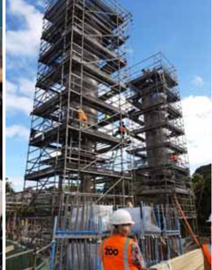
Auckland Zoo redevelopment