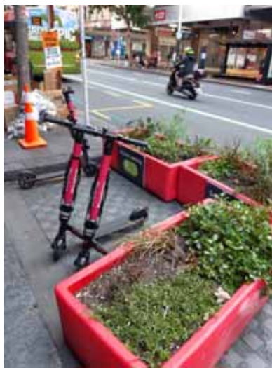
The way that bikes and scooters could be catered for, and parked safely off the footpath, in our Town Centres