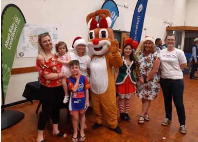
Carols at Potters Park