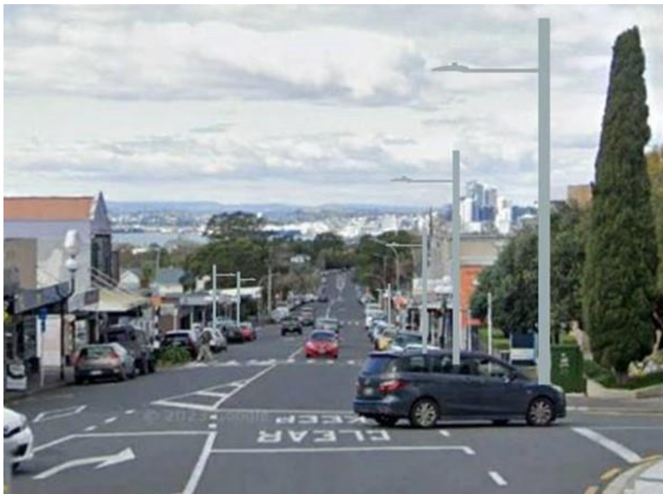
View down Hinemoa Street showing proposed Black and Grey town centre columns.