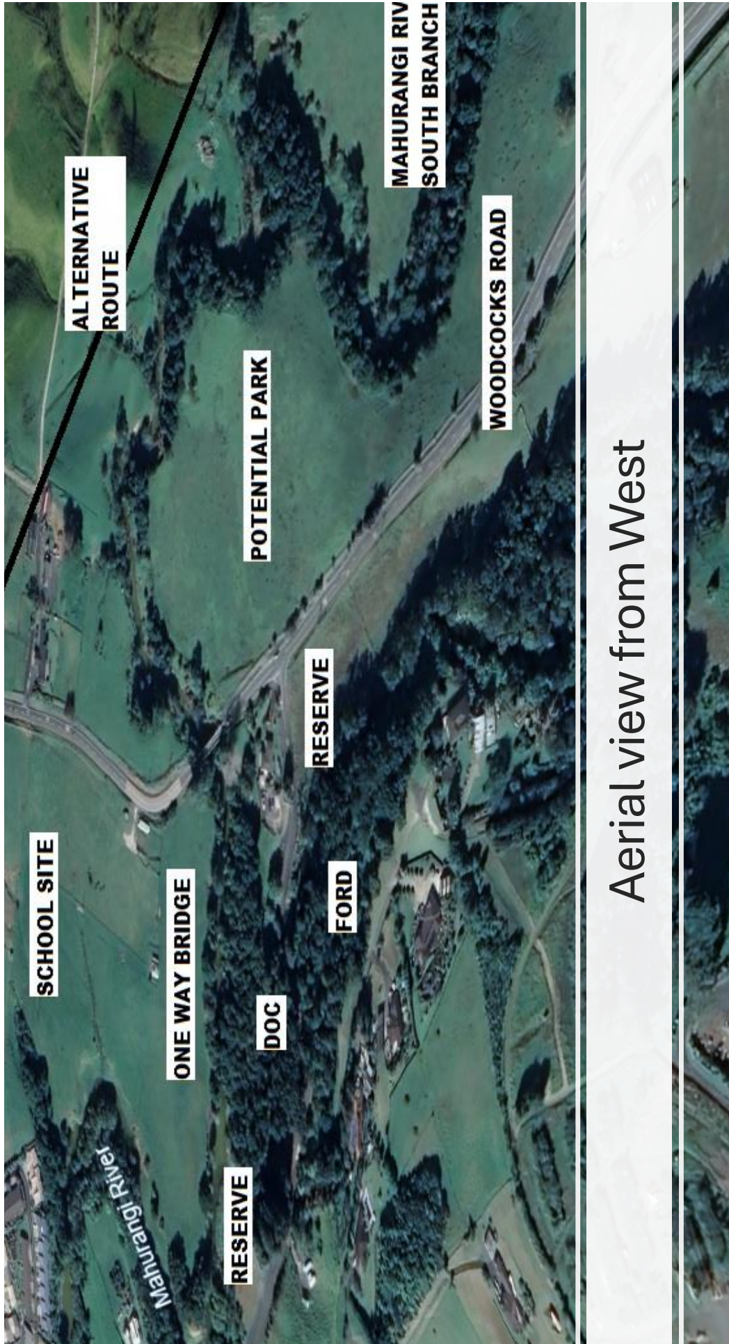
Aerial view from West