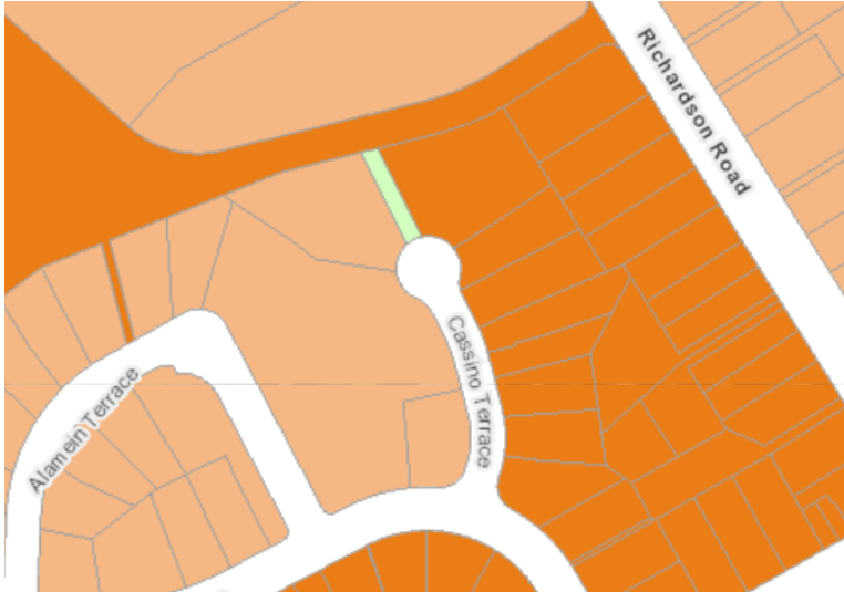
AUP Map Reflecting PC60 Decision