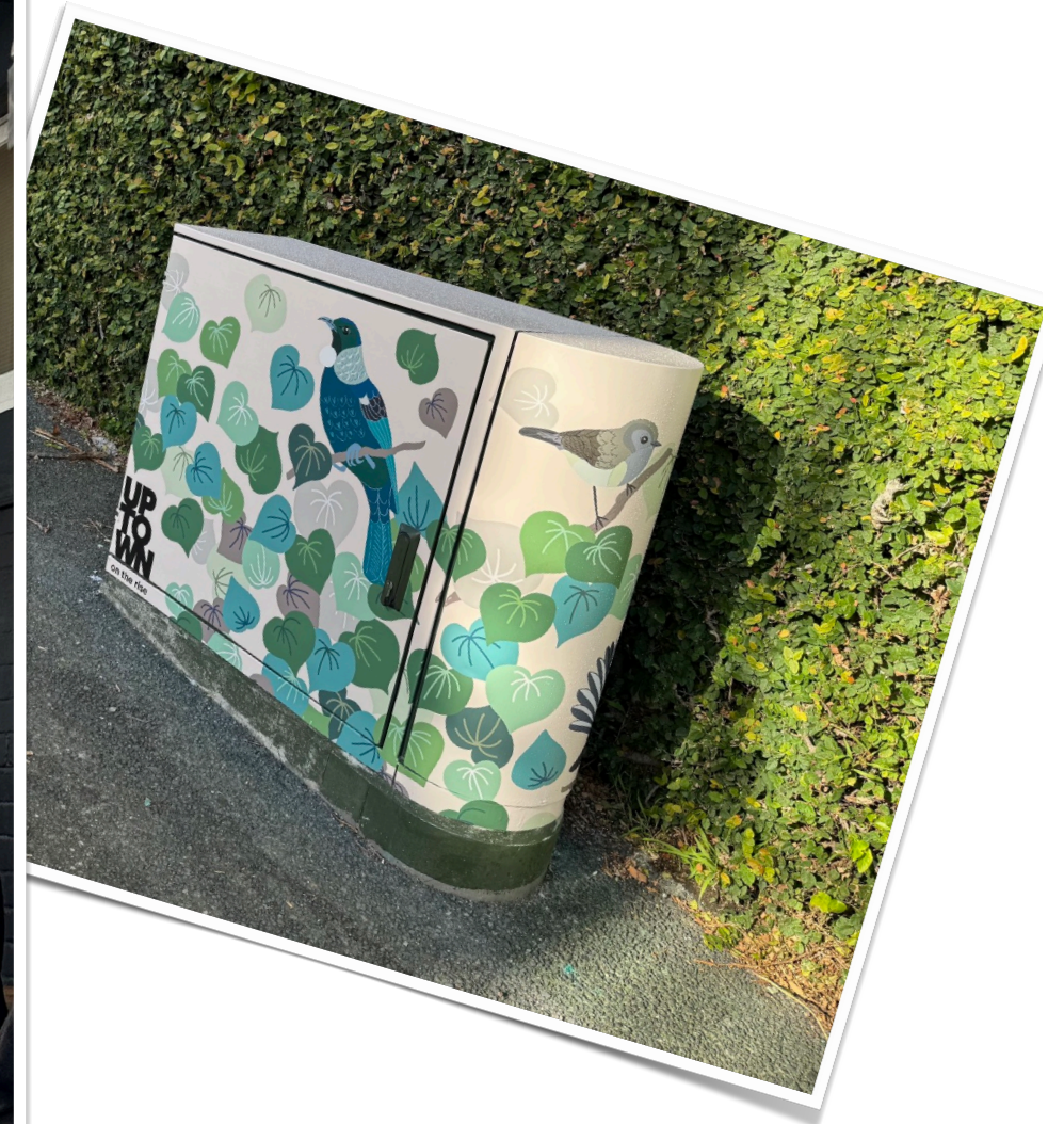
Dining Guide, Magazine & Street Art