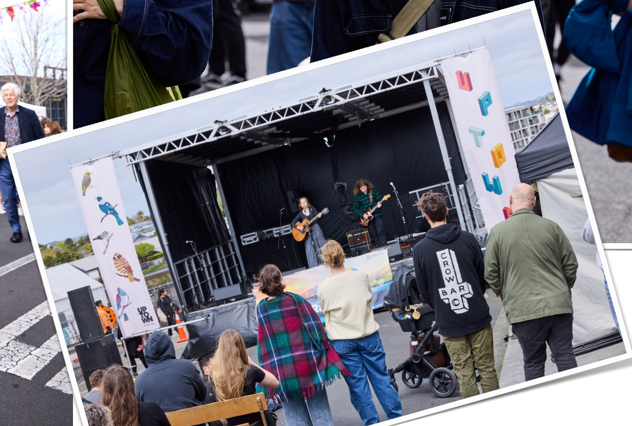
“Branch Out” Street Festival