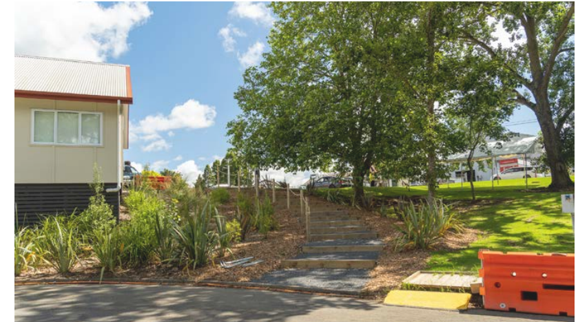
Papakura Marae and parking lot from Parker Street end