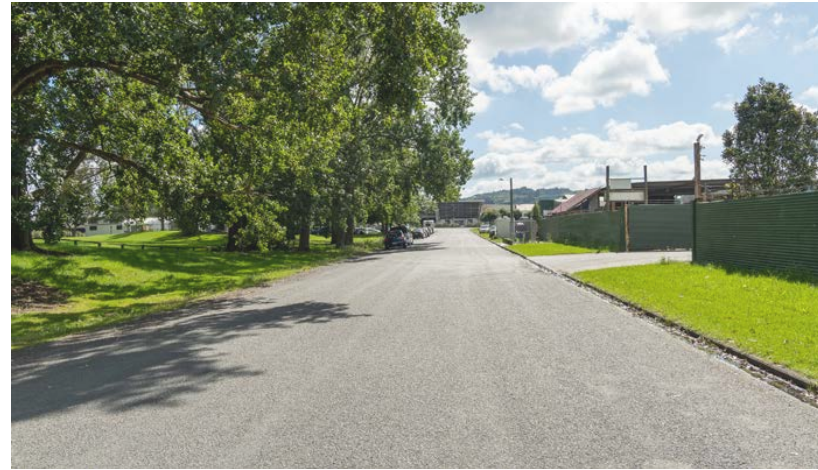
Park street boundary and neighbouring JCP Car Parts store fence