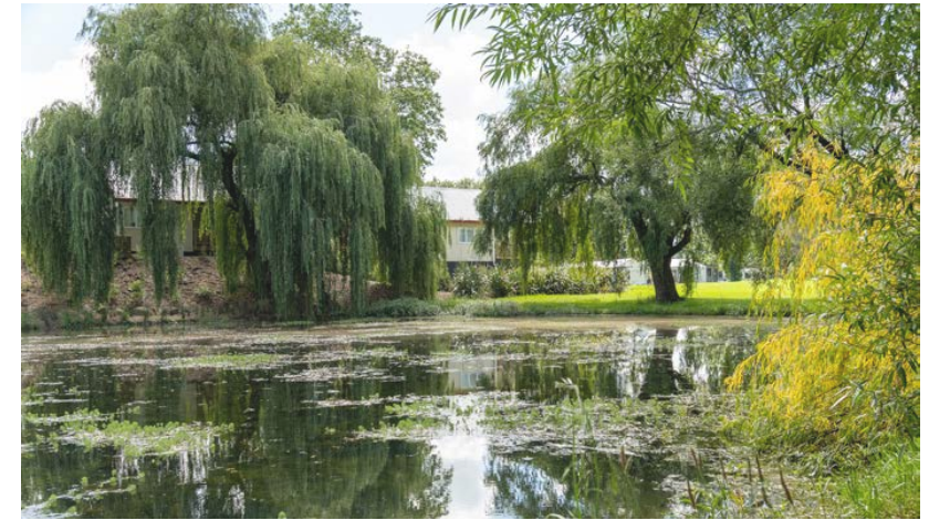
Northern treatment basin, planted embankment and Kaumātua housing units