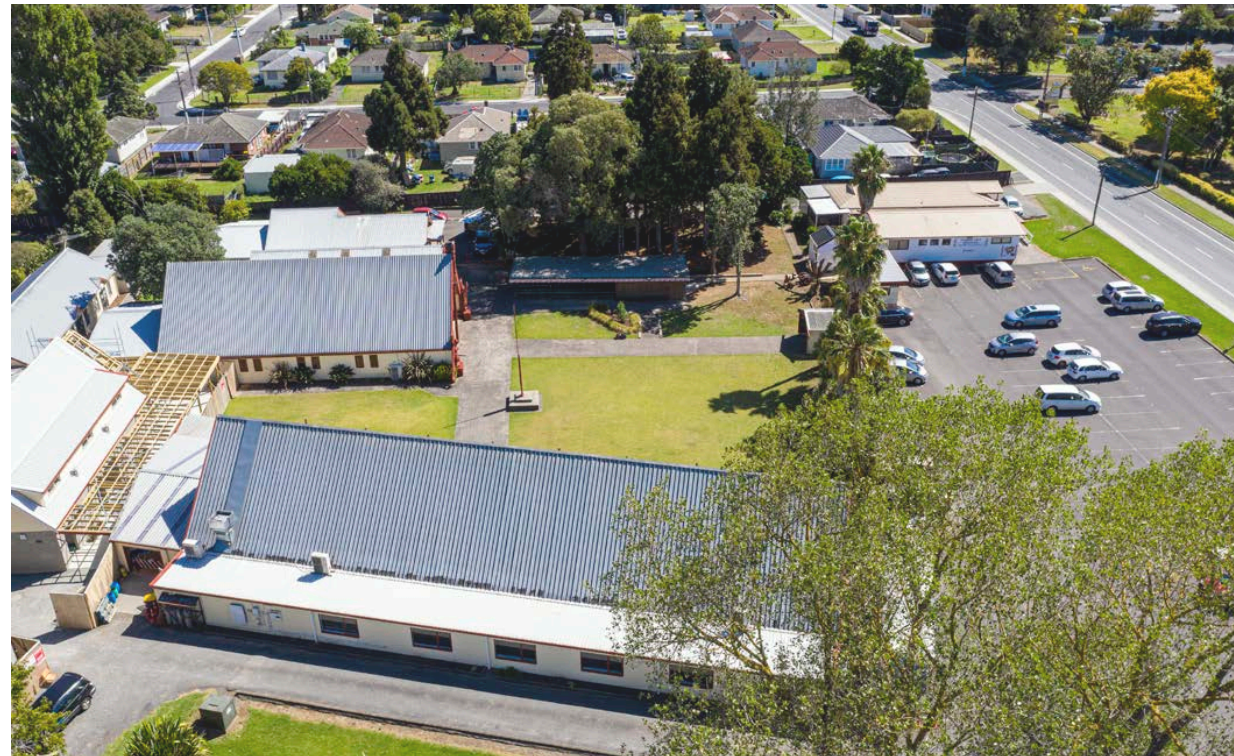
Aerial view of Papakura Marae and parking lot from the south