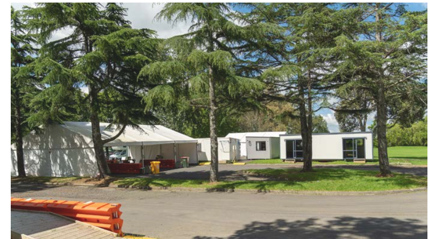
Papakura Marae and parking lot from Parker Street end