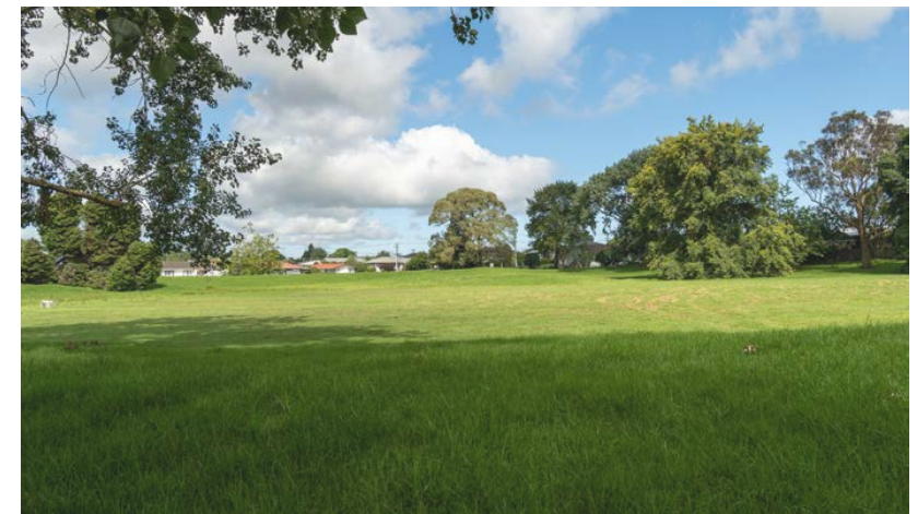
Western open space space, boggy ground and tyre tracks from 'donuts'