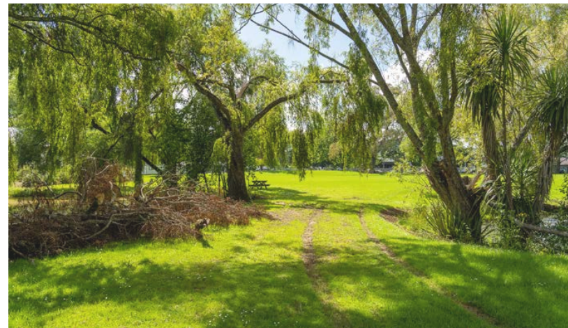
Access way that separates the two ponds and links open spaces