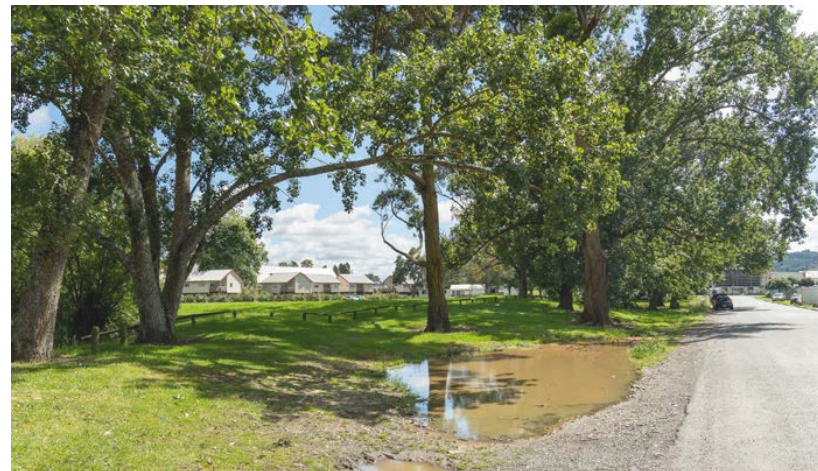
Pooling in some areas along parker street due to poor drainage