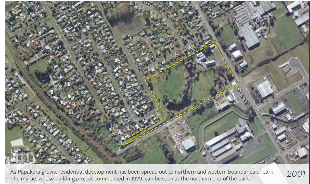
As Papakura grows, residential development has been spread out to northern and western boundaries of park. The marae, whose building project commenced in 1979, can be seen at the northern end of the park.