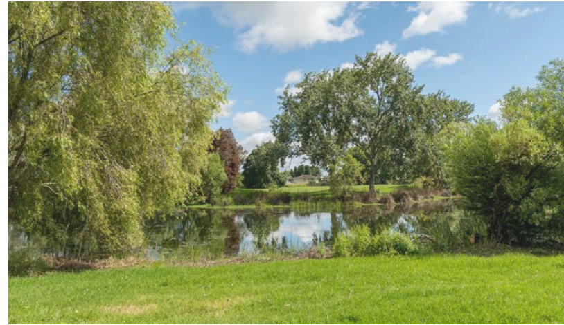
Western open space viewed from southern treatment pond