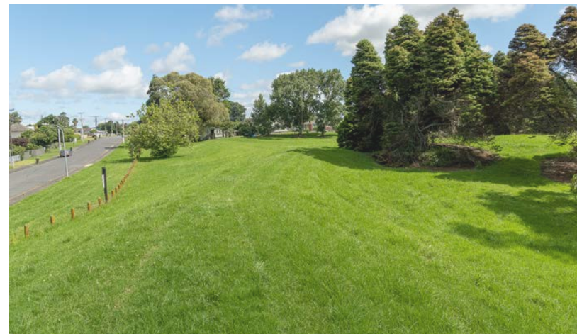
Bollards and mounded earth along boundary, tyre tracks from both maintenance and non permitted vehicles