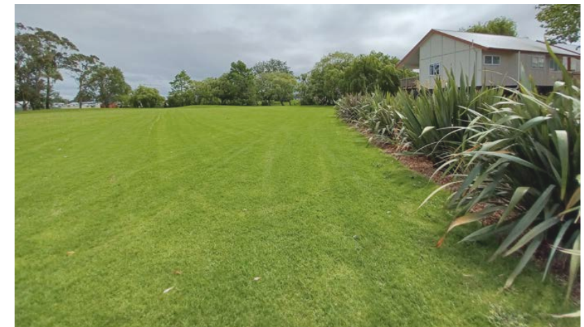
Te Koiwi Park open field and Kaumātua housing units