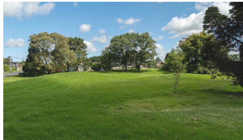
Western field and neighbouring residential area