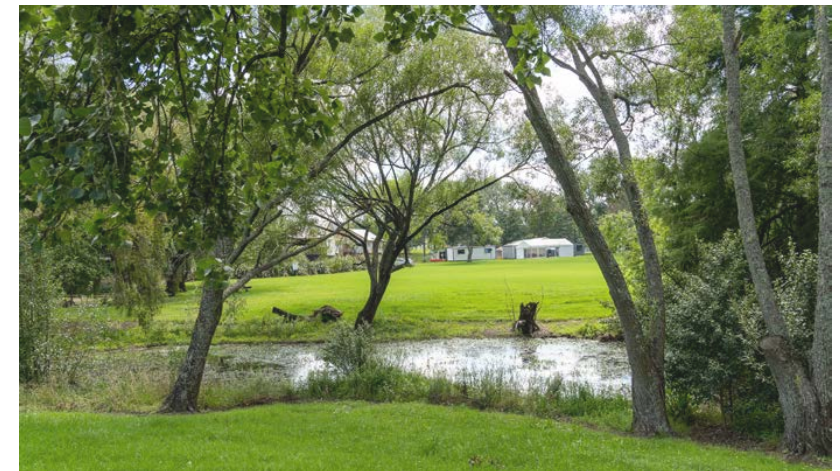
Marae Parker Street carpark and eastern open space visible from western open space