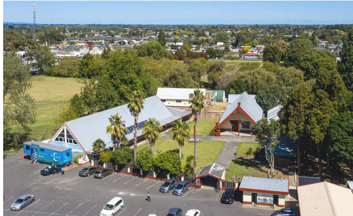
Aerial view of Papakura Marae and open space within Te Koiwi Reserve from the east