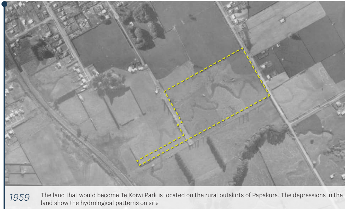
1959 The land that would become Te Koiwi Park is located on the rural outskirts of Papakura. The depressions in the land show the hydrological patterns on site