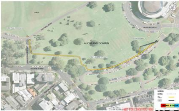
Site 1 - Titoki Street to Football Road