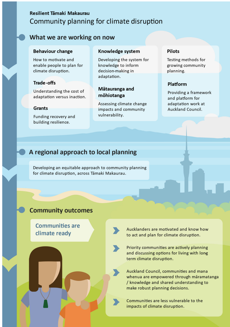
Figure 2. Community planning for climate disruption

17. We are delivering a range of mahi that will help us and the community be climate ready. These are summarised in Figure 2.