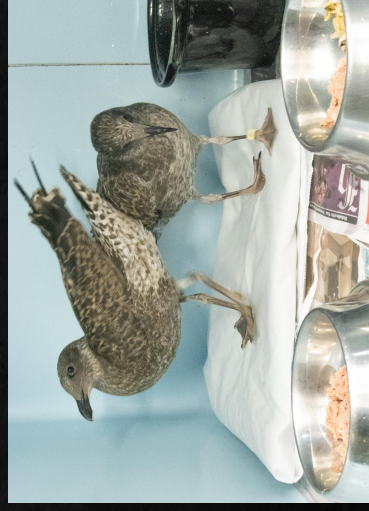
Species identification by beak profile; Triage examination of Kōtare;