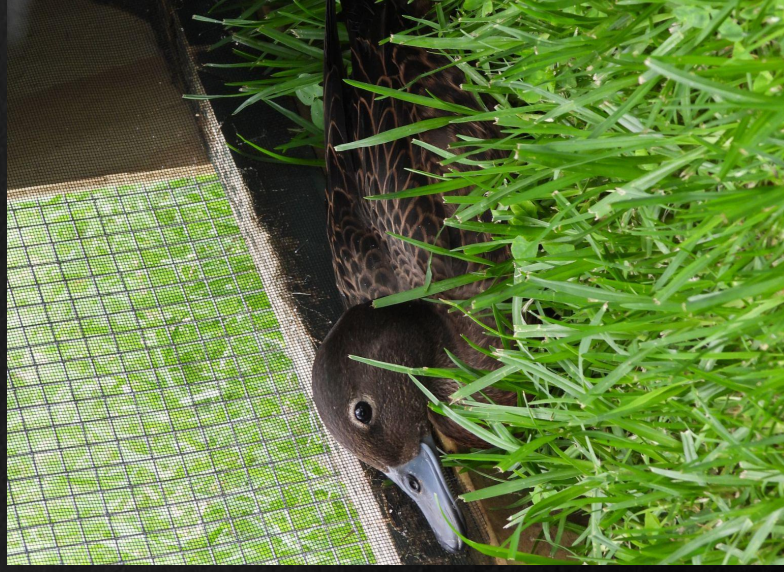
Pāteke Brown Teal