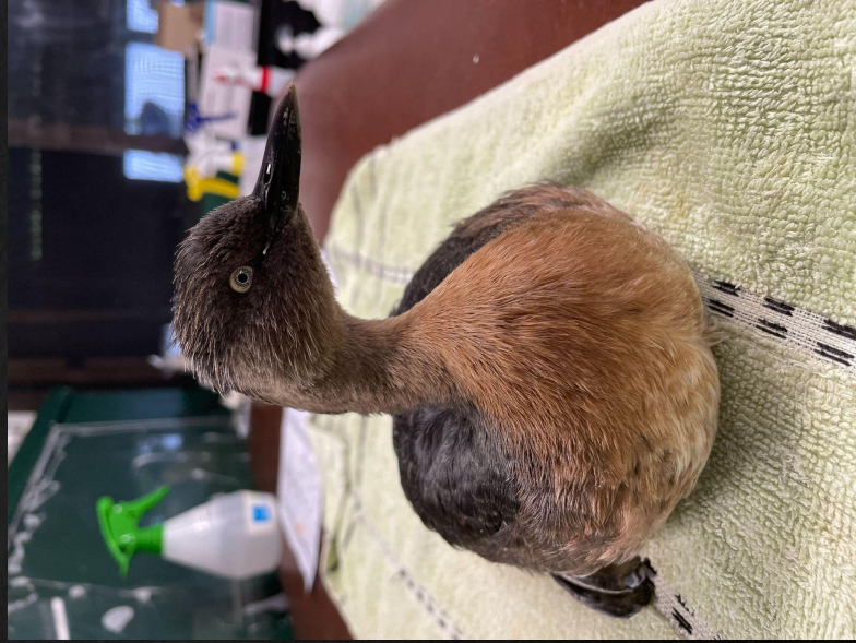
Weiweia NZ Dabchick