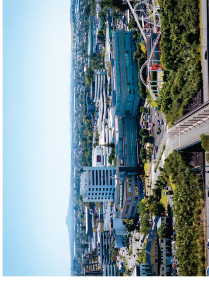
Drone image of Manukau