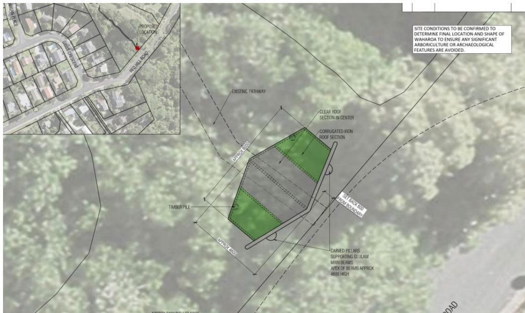
Figure 2 – Pukekiwiriki Waharua structure layout plan