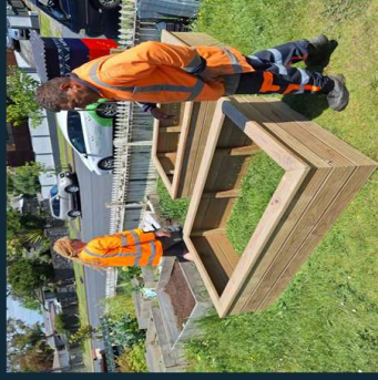
Randwick Planter Boxes