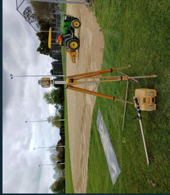
Mountfort Park Diamond levelling