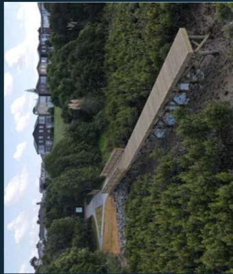
Kaimoana Reserve Jetty