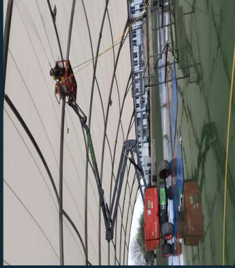
Manurewa Netball Centre