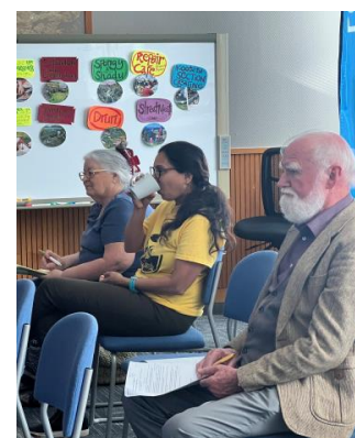
Image: Papakura Participatory grantmaking workshop