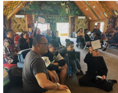
Image: Climate Workshop with Whānau Hauā and disability community at Papakura Marae