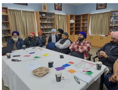
Image: Climate Ready workshop with members of the Gurdwara Sri Kalgidhar Sahib Sikh Temple in Takaanini

10. Regional seed funding ($85,000 in 2024/25) is available for community-led Climate Ready priorities. Community participants used a participatory grantmaking approach to decide how this funding will be used (refer Table One ). Staff will work with project leads to ensure alignment and coordination with related Auckland Council work programmes.